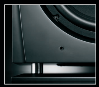
The gap hides the massive flared 4" diameter bass port.