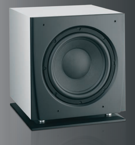
This front-firing performance subwoofer will add sheer definition by coherent integration of the bass tones.

In most music and movie production of today, bass has top level priority. The IKON SUB MK2 is designed to be a highly flexible and comprehensive solution to all your bass needs: Powerful, full-bodied, fast and well defined. The bass performance of The IKON SUB MK2 is superb because of the careful matching of driver, enclosure and amplifier. The cabinet sports a solid two-layer front baffle in order to create the ultimate working environment for the 12" front-firing long-stroke woofer, while the cabinet itself is elevated from a base beneath. The downward firing, flared reflex port is carefully tuned to extend the length and to widen the propagation of the lowest frequencies in order to eliminate turbulence and other distortions which occur at high air speeds. The IKON SUB MK2 is a surprisingly cost-effective solution and offers both impressive bass for movies and acoustic coherence for your stereo system.