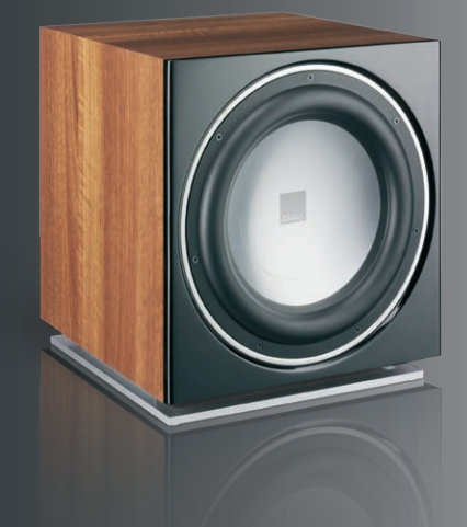
Powerful and precise performance combined with traditional aesthetics - a true cla