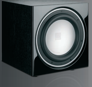
A big sound and a compact size – all in one subwoofer.