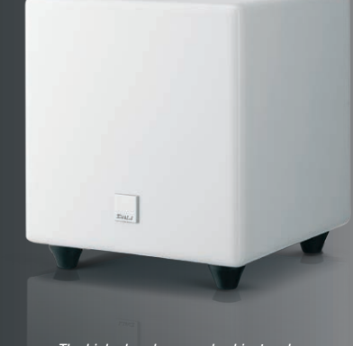
The high gloss lacquered cabinet makes the FAZON SUB 1 looks as wonderful as it sounds.