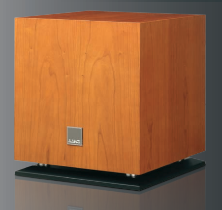
DALI MENTOR SUB provides a beautiful piece of furniture for your living room - a wolf in sheep's clothing....