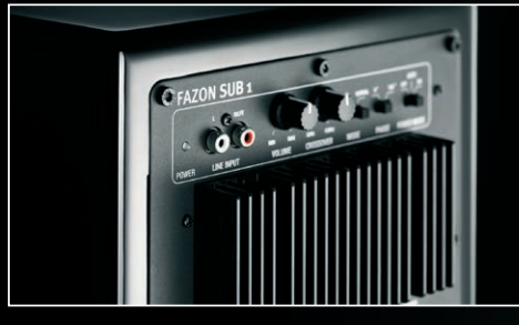
The amplifier and connection panel are placed on the rear side above the efficient heat sink ensuring optimum power.

With a careful balance between signal equalisation and time response, the FAZON SUB 1 provides surprisingly well-defined and tight bass. Although small in size, the FAZON SUB 1 offers musical and natural bass performance. With dimensions of only 255 x 230 x 255 mm, FAZON SUB 1 is the most compact subwoofer ever built by DALI. It features a 61/2" long-stroke, down-firing woofer mounted in a closed cabinet and due to its compact size it can be easily positioned in a room to deliver perfect acoustic coupling. And, despite its diminutive appearance, the FAZON SUB 1 offers much greater bass quality than many larger subwoofers.