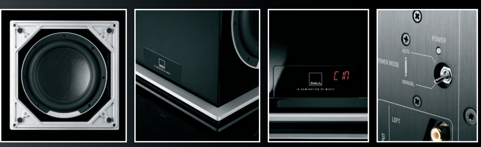
Carbon fibre cone, dual spider, ultra long throw woofer. Elegant high-gloss lacquered cabinet. LED display confirms all settings changed by the remote control. Optional auto power on/off.

This long-stroke design woofer features rigid carbon fibre cones, dual spider, low loss suspension, and a massive magnet system, all fitted into an elegantly styled and compact enclosure. Combined with a powerful linear power supplied digital amplifier, the DALI SUB P-10 DSS features a massive downward-firing woofer, able to move plenty of air with speed and attack. Two passive woofers blend in at the absolute lowest frequencies, and the three 10" cones sets a new standard for cone surface to cabinet volume ratios. To ensure a stable working environment for the "motor", the base of the cabinet is made from 25 mm plywood, eliminating any mechanical loss or resonance. The DALI P-10 DSS can be controlled by a proprietary remote control, and features personal memory sound settings and dedicated presets for cinema and music, thus allowing optimum system integration and versatility.